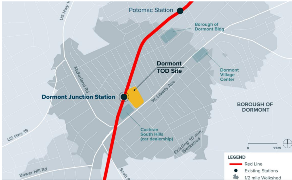
Dormont Junction Station TOD site context and 1/2 -mile walkshed